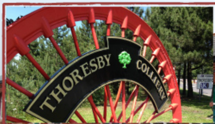
Thoresby Colliery - 9

June 2015 - www.edwinstowe.co.uk - edwinstowe.pc@btconnect.com - 01623 824243