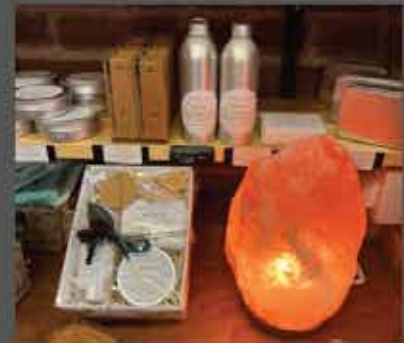
Self-care gifts and accessories