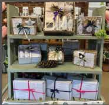
Skin and hair care products